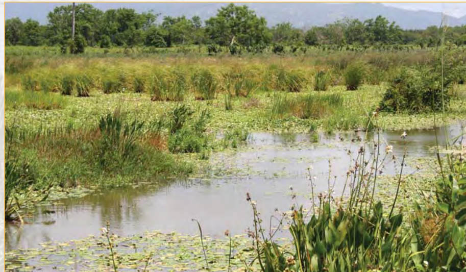
Wetland restoration project, Puerto Rico.

The new rule will improve the ecological success of compensatory mitigation efforts through better site selection, the use of a watershed approach for planning and project design, and use of ecological success criteria to evaluate and measure performance of mitigation projects. Using a watershed approach, mitigation project sites will be selected to offset permitted losses of aquatic resources and to provide ecological benefits to an entire watershed.