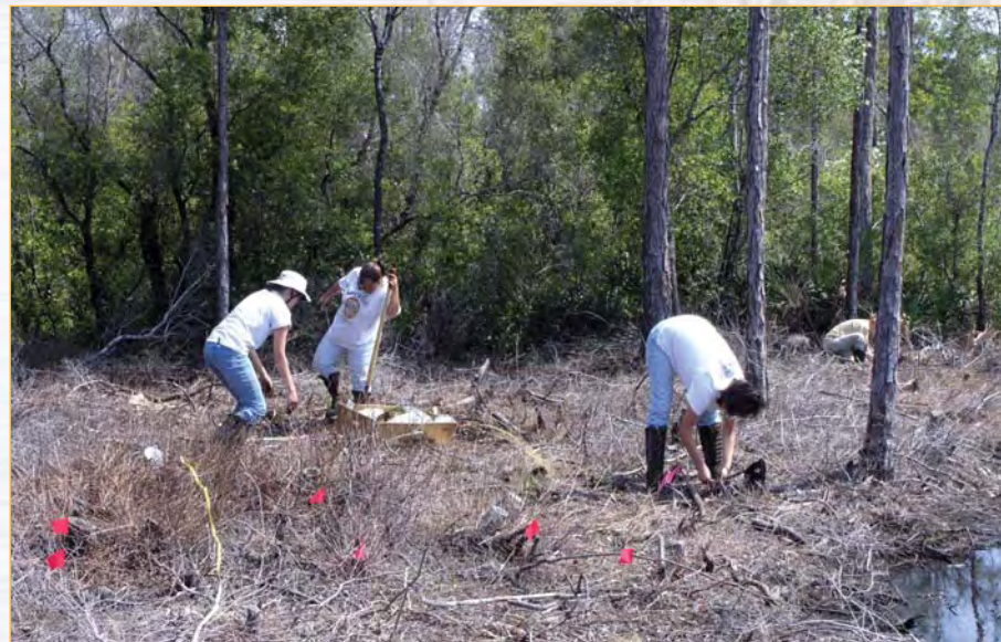
Wetland mitigation planting project, Florida.

Permittee-responsible mitigation: Individual projects constructed by permittees to provide compensatory mitigation for activities authorized by Corps of Engineers' permits.