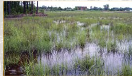
Wetland creation—first season.