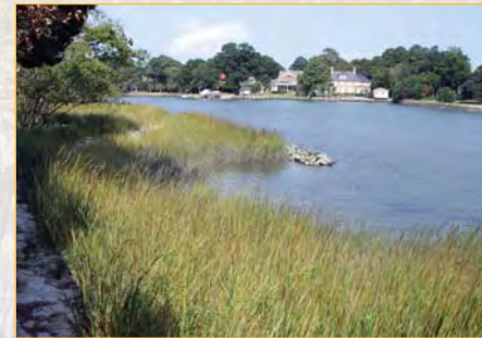
Wetland creation—second season.

Lafayette River, Virginia.