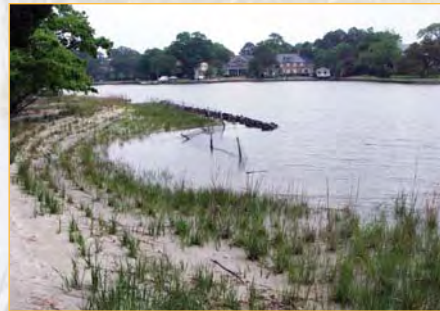
Wetland creation—first season.

The rule also preserves existing mitigation requirements by ensuring that environmental impacts are avoided and minimized wherever possible. The rule does not affect the Corps of Engineers' current regulatory jurisdiction under Section 10 of the Rivers and Harbor Act of 1899 or Section 404 of the Clean Water Act.