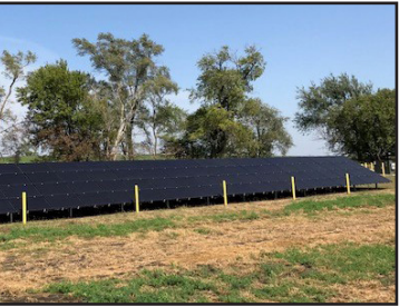
Focused Extraction Well FEW-14 Solar Array

Former Nebraska Ordnance Plant Mead, Nebraska